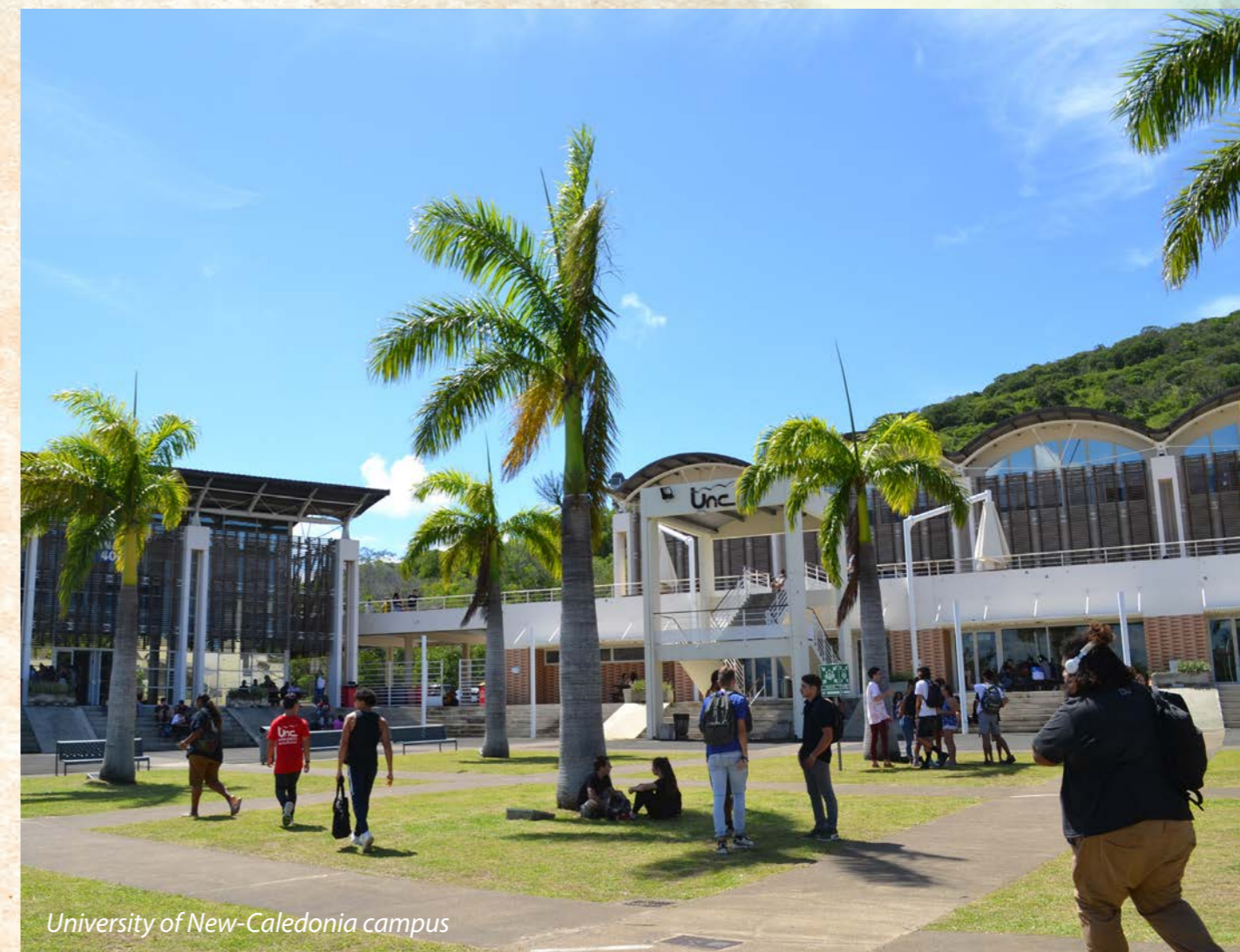
University of New-Caledonia campus