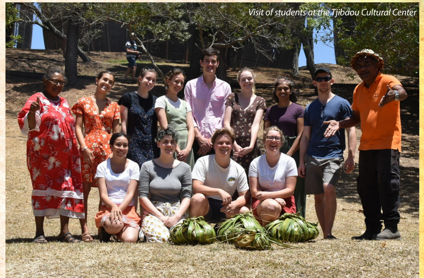
Visit of students at the Tjibaou Cultural Center