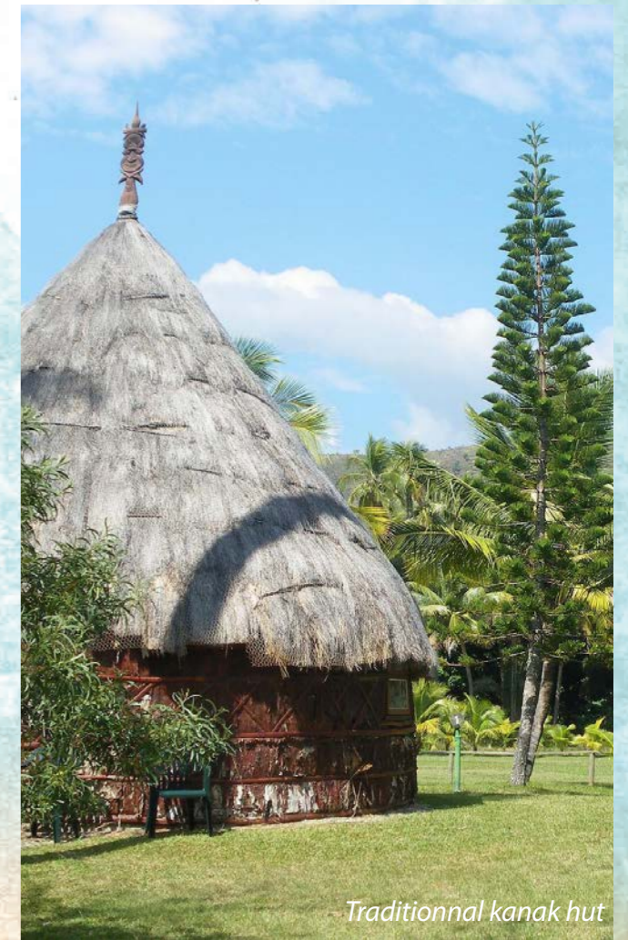
Traditionnal kanak hut