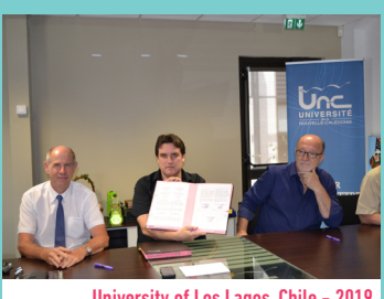
University of Los Lagos, Chile - 2019