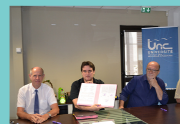
University of Los Lagos, Chile - 2019