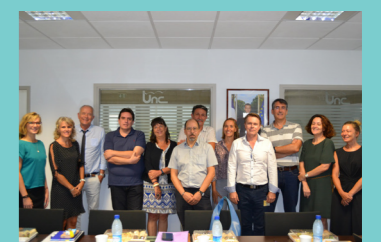
Delegation for the Pacific future platform - 2020