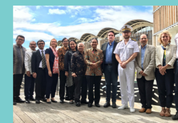
Consul general of Indonesia - 2019