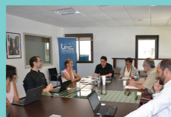
AUF Asia Pacific Director - 2019