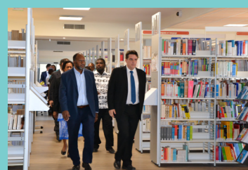
French Ambassador for Vanuatu - 2019