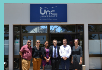
Ambassador for Fiji - 2019